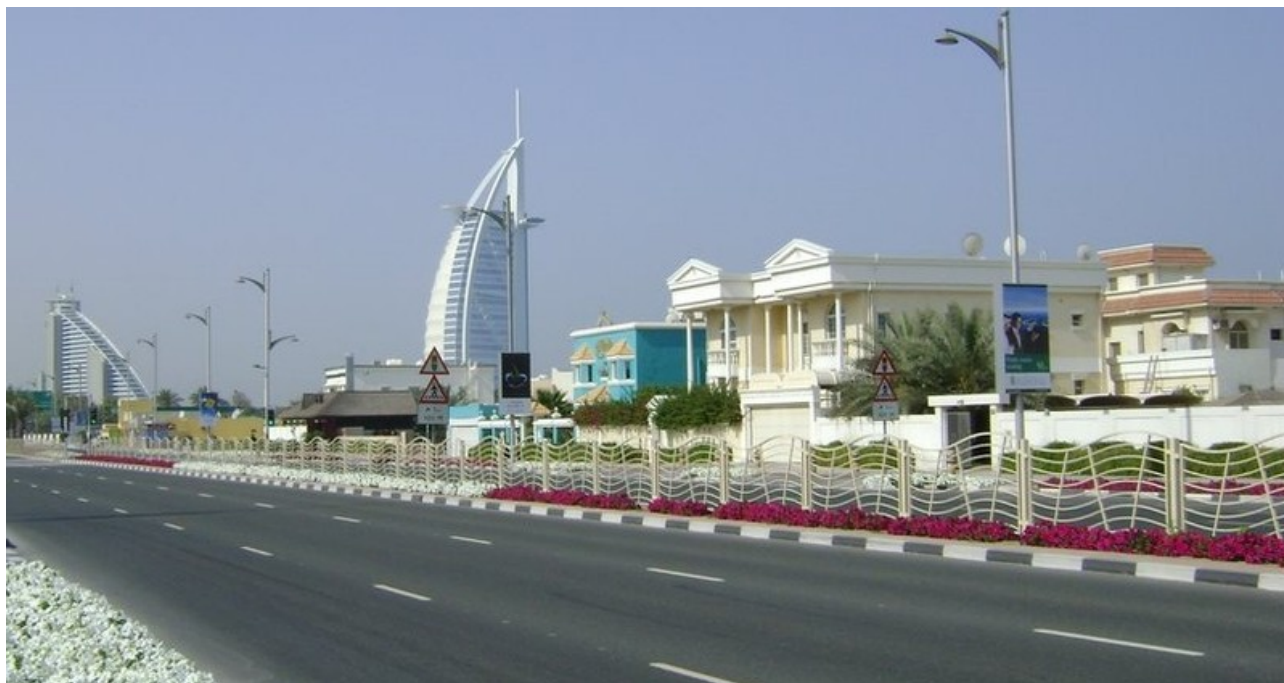
*This property is subject to availability and the price is subject to change. Size may be approximate and images may be generic.